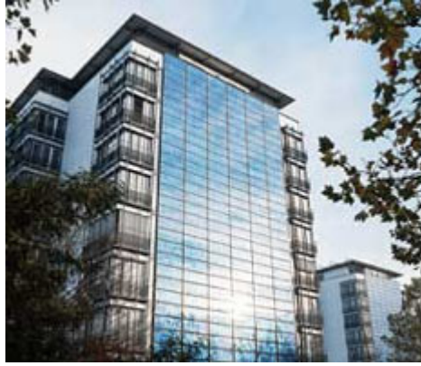
PV façades in Tübingen (left) and Freiburg.