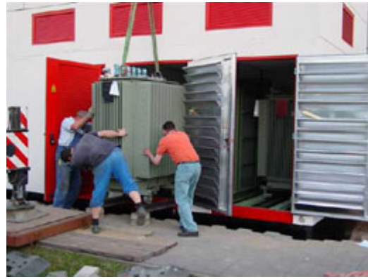
Row by row solar modules are installed on the roof. Assembly of one of the large inverters.

The costs of this large-scale solar power plant are estimated by TAUBER SOLAR to amount to approx. 17 million euro. Per kilowatt of peak performance the system price was 4.415 €. Project management was done by the engineering company IBU from Karlsruhe, the installation was done by the company activ solar (Tauberbischofsheim and Friedelsheim/district of Bad Dürkheim) that is now in charge of maintenance of the entire solar power system.