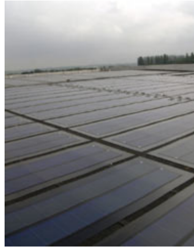
PV roof with thin-layer modules of the company Biohaus.

The bitumen flatroof has a total surface of 12 000 square metres of which three quarters are covered with modules. The company Colruyt is not only attempting to establish a “green” image through the utilisation of renewable energies – the long-term goal of the discount store is to cover their own energy demand to a large extent with regenerative energies. Besides the photovoltaic system, the property in Halle also boasts a wind power station. A 2MW turbine at another location, the participation in a planned wind park in Ypern, as well as investments in offshore wind projects are further proof of the ecological commitment of the company.