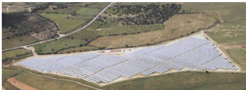
10 MWp solar power plant Alconchel.