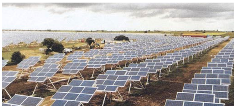
15 MW solar power plant in Mahora.

"Yes. City Solar has an inbuilt facility for research and development that works on cost reduction or efficiency improvement strategies throughout the supply chain. An example is our new tracker system that is 40% cheaper to make and has a 22% higher yield than other ground-mounted systems. Two projects in Spain's Albacete are using these systems; one 15MWp system in Mahora goes live in July 2008."