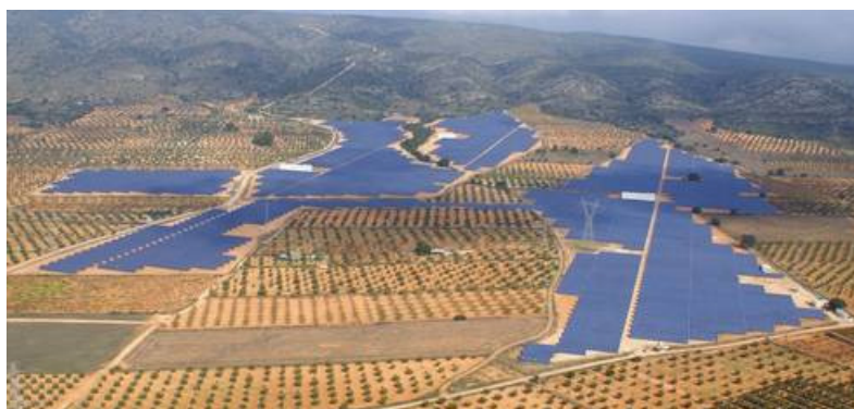
At Beneixama (Spain) City Solar built one of the world's largest PV plants.