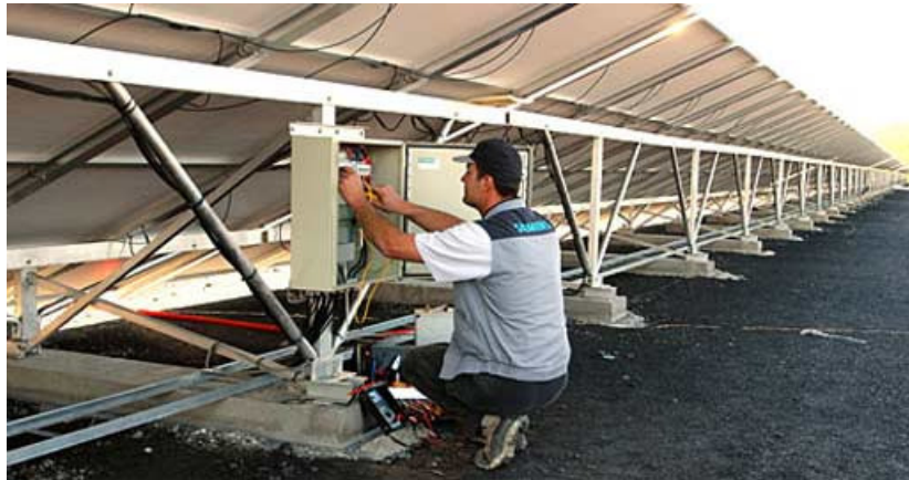
A Siemens engineer installing modules at a City Solar facility.

"They are very important for the running of a solar power plant. We work together with Siemens - in 2003, when our first power plant was built up at the Saarbrücken airport, Siemens was permanently involved in the construction. Siemens supplies inverters, transformers, substations, and takes care of the engineering as well as the electrical fittings. The example of our transformers demonstrates our strategy: we use dry-type transformers (Geafol), as, even though they are more expensive to buy than oil transformers, they do not need servicing, operate more efficiently and are environmentally friendly."